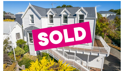
1 Parliament Street, Thorndon

Thank you for your positive feedback and support for me at Tommy's Real Estate. I've truly enjoyed helping those who have been in contact. Just a reminder—I'm more than happy to provide free market appraisals with absolutely no obligations, especially after the recent RV changes. If you're interested, feel free to give me a call on 021 969 808!