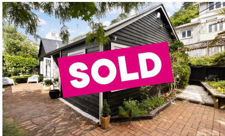
3 Lewisville Terrace, Thorndon