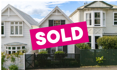
33 Grant Road, Thorndon