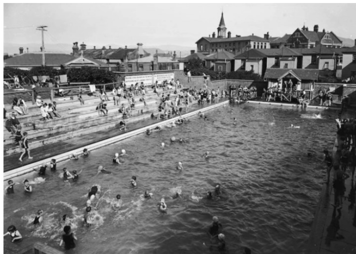
Thorndon Pool.

Let's support our local amenity. A lovely time can be had by young and old in this sunny, safe, relaxing haven.