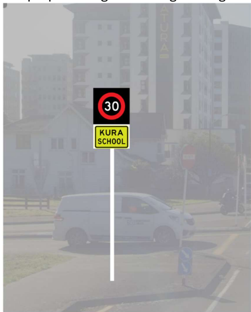
Hawkstone St (North Side)

The proposed signs marking the beginning/end of the VSL are adjacent the school