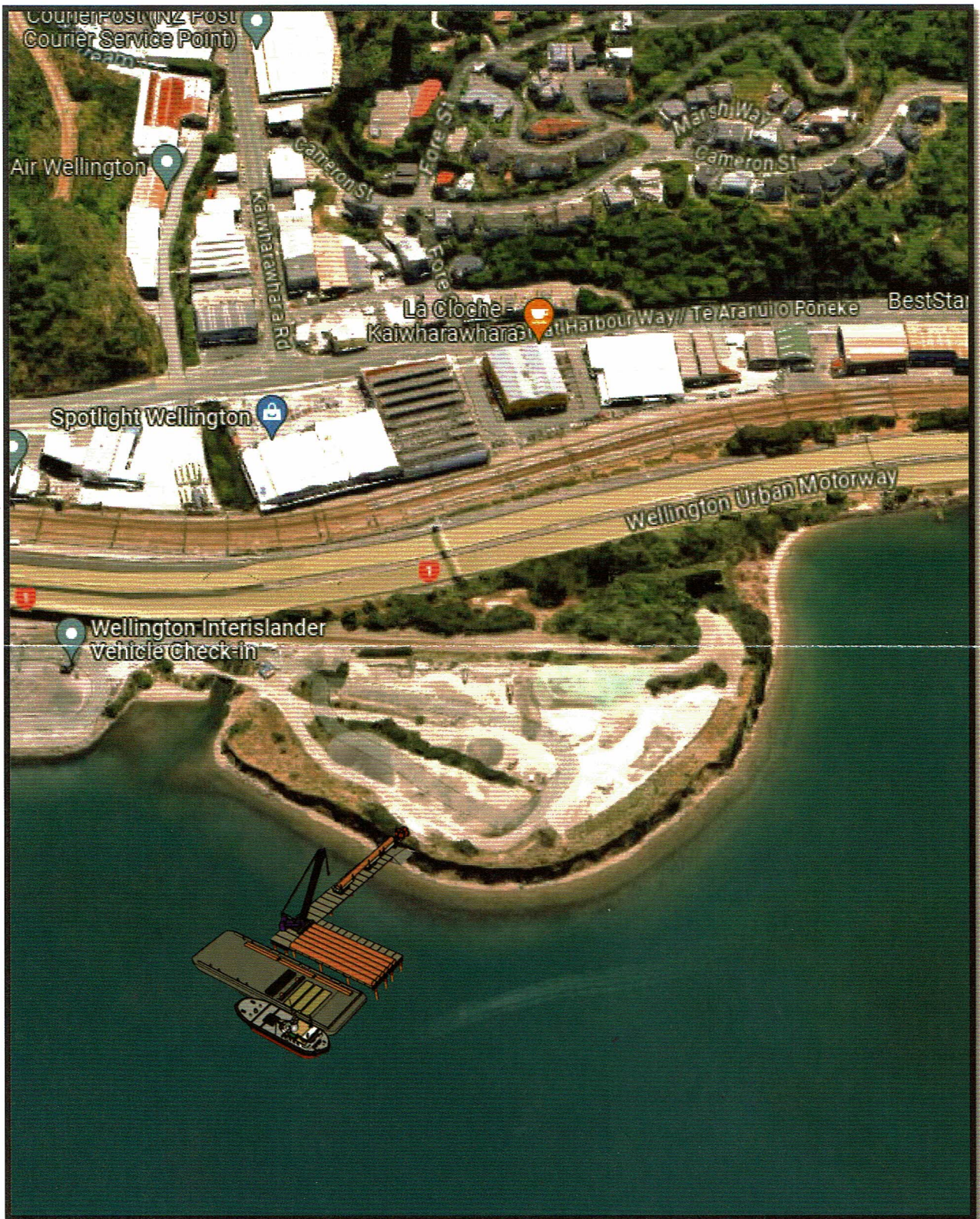
Illustrated example of temporary jetty location off Kaiwharawhara Point.